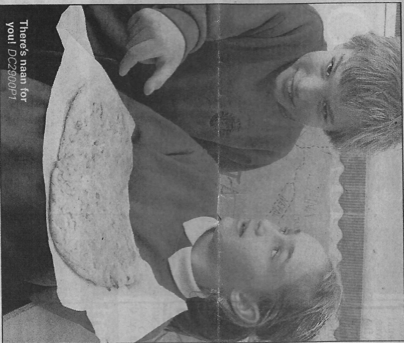
There's naan for you! DC2900P7