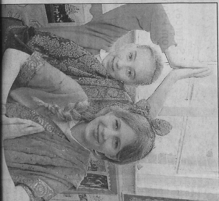
Children with artwork inspired by India.